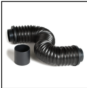
4ft Hose Extension