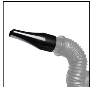
Tapered Hose Fitting