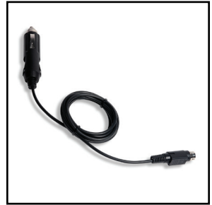
12V Power Supply