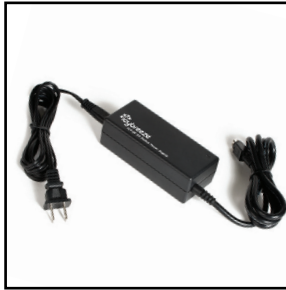
110V Power Supply